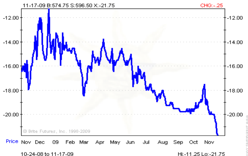
WZ09 - WH10 Daily Spread

as other outside influences for the anticipated 2010 production. We are well aware of the softness presented by weak year-over-year fertilizer prices and other inputs but the hedge, spread and host of trading opportunities are numerous and we must act now.